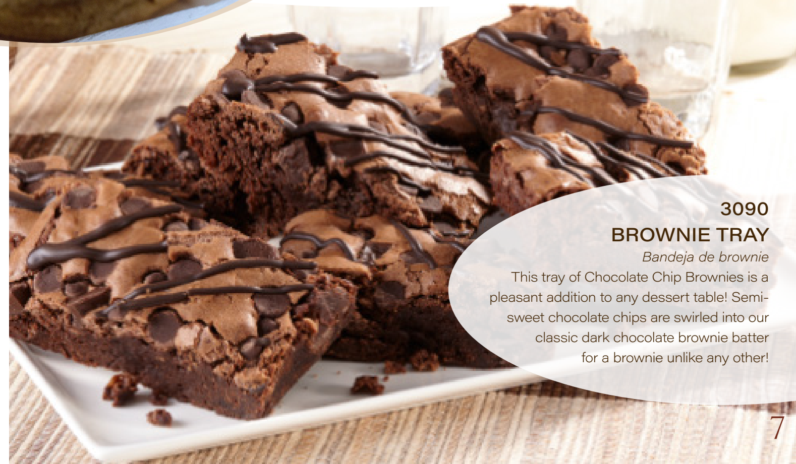
3090 BROWNIE TRAY

Bandeja de brownie This tray of Chocolate Chip Brownies is a pleasant addition to any dessert table! Semi- sweet chocolate chips are swirled into our classic dark chocolate brownie batter for a brownie unlike any other!