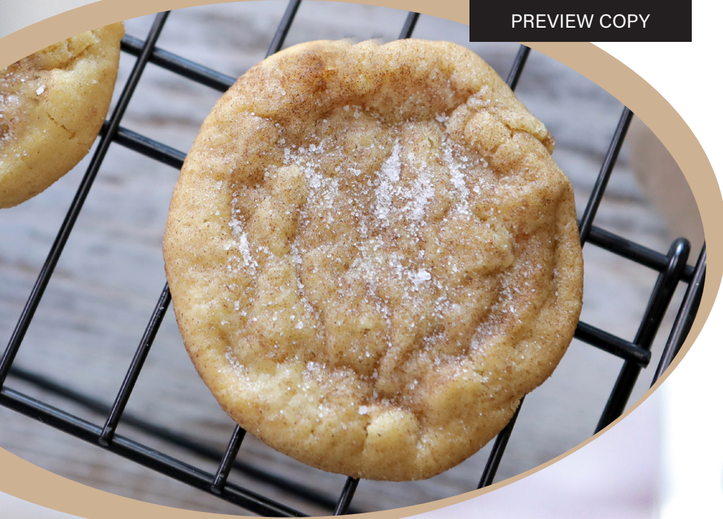
2004 SNICKERDOODLE Galleta de Azucar con Canela Delightful cinnamon sugar simplicity. @.