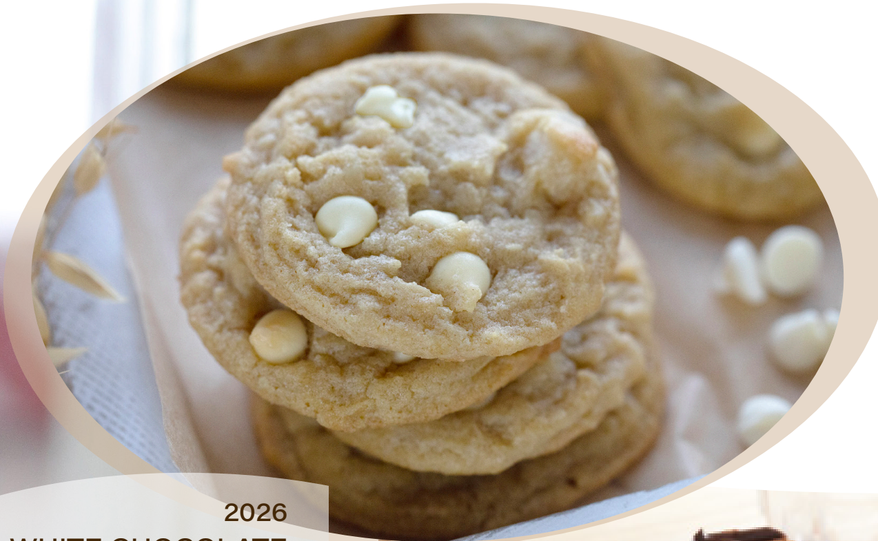
2026 WHITE CHOCOLATE MACADAMIA NUT

Galletas con chocolate blanco de nuez de macadamia MAC-A-DAMI-YUM! The subtle flavor of roasted macadamia nuts and melty white chocolate goodness. @.